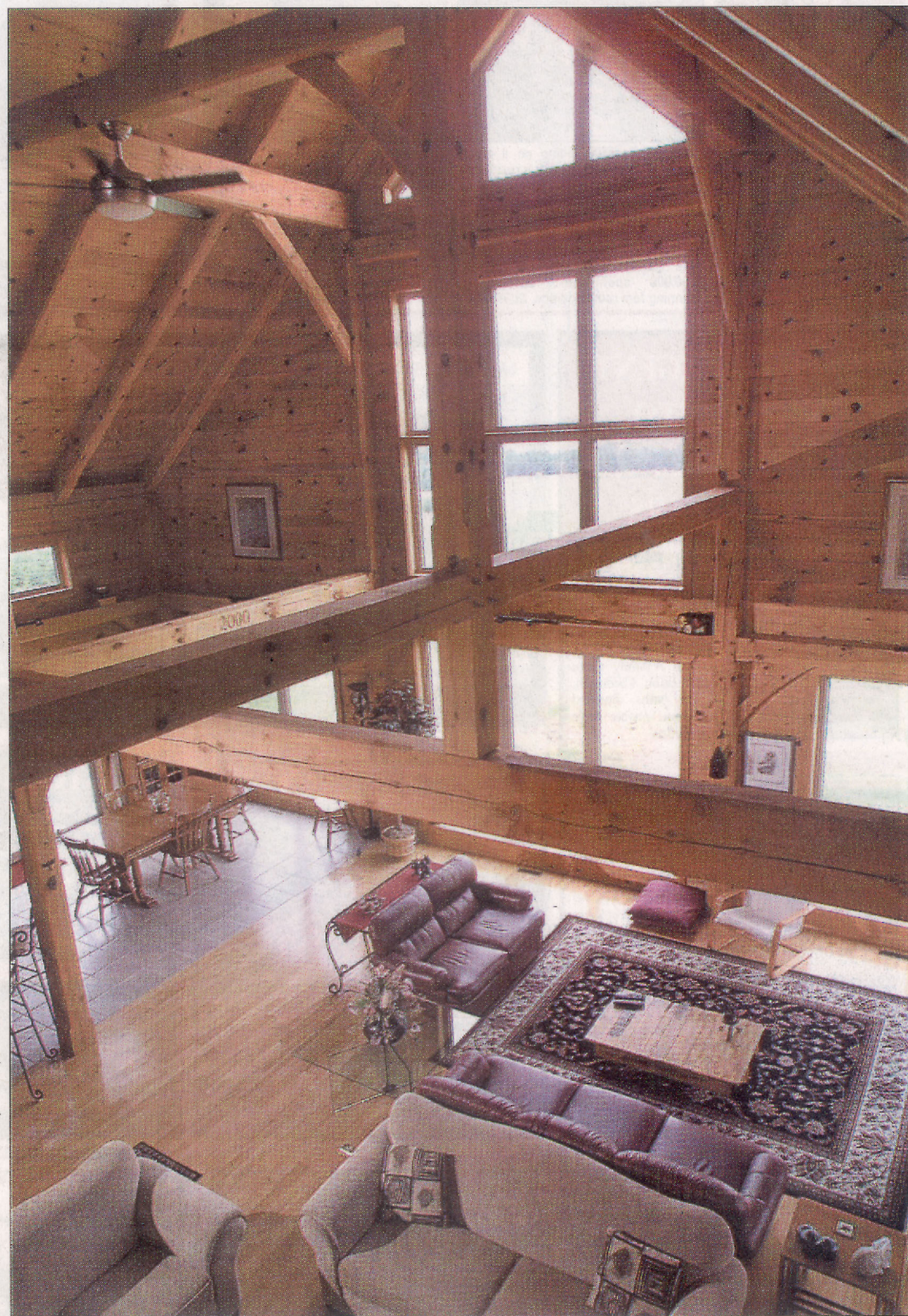
Pine lair: Wood beams and a three-storey cathedral ceiling and windows in the great room, right, take advantage of the panoramic views; left, the cozy master bedroom loft.